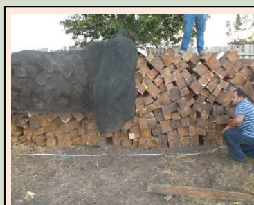
Increased rosewood interdiction