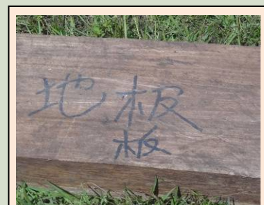
Disruption of Chinese mafias